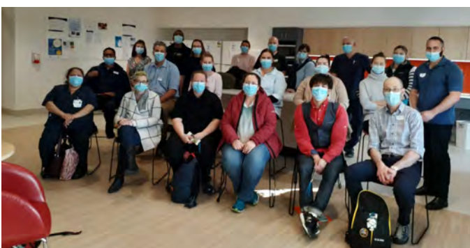
ALS Instructors Workshop July 2021

Executive Officer & Training Support Riverina Regional Training Hub | Rural Clinical School Sydney School of Medicine | University of Notre Dame Australia