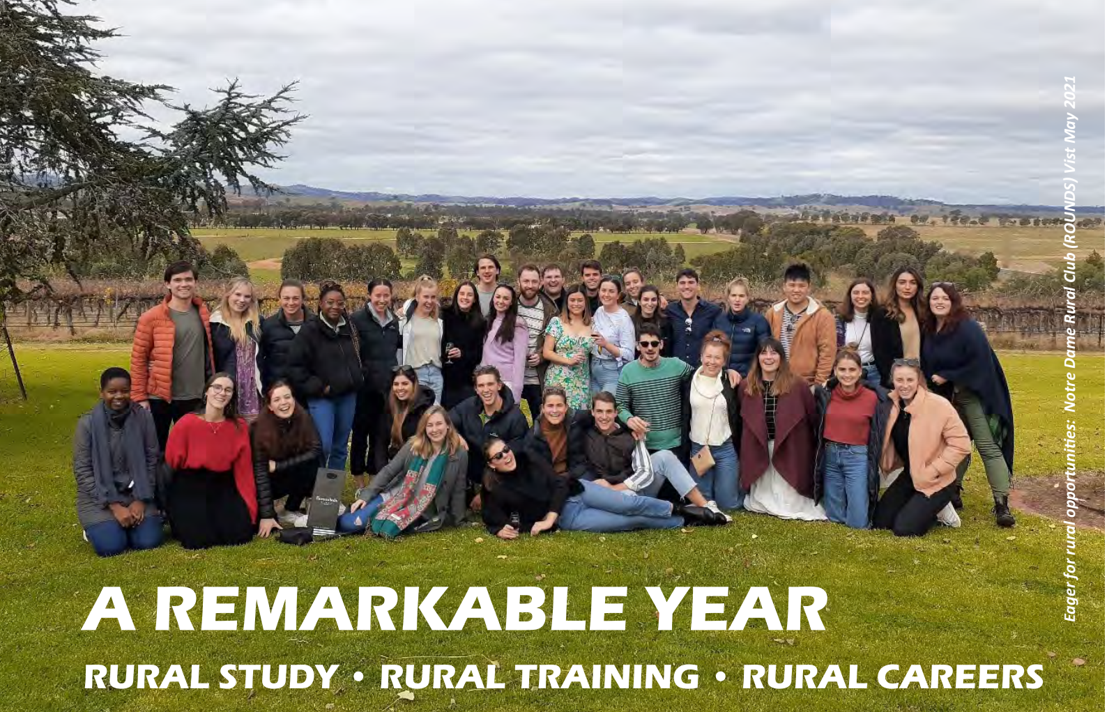
Eager for rural opportunities: Notre Dame Rural Club (ROUNDS) Vist May 2021